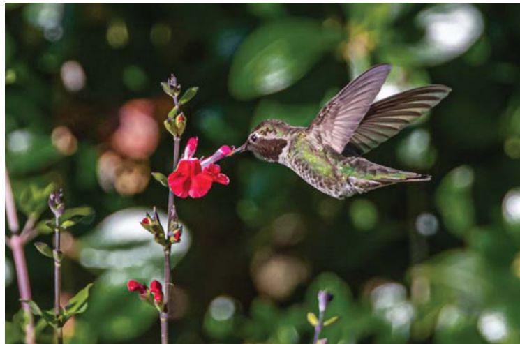
Anna's Hummingbird Front Yard