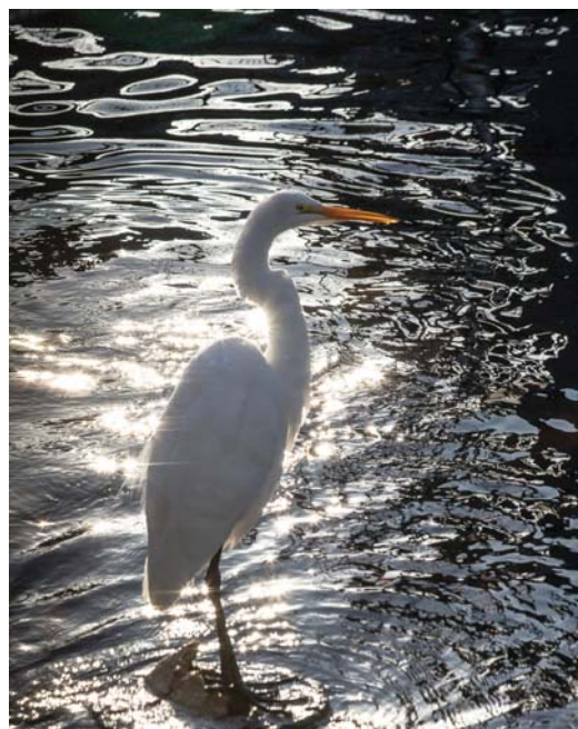
Great Egret in Early Morning Light Chris Parsons